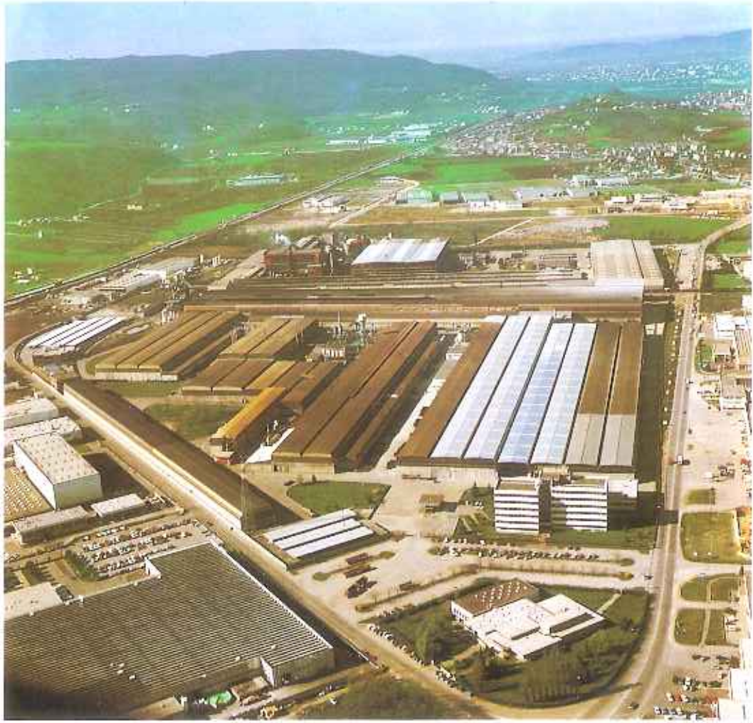
Aerial view of Vicenza plant.